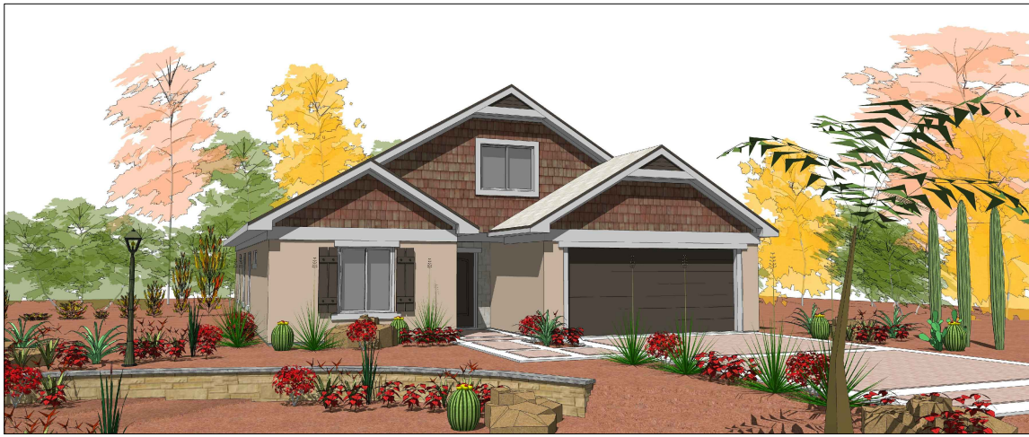
Exterior Option 2