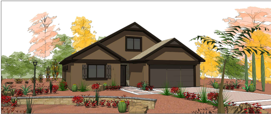
Exterior Option 1